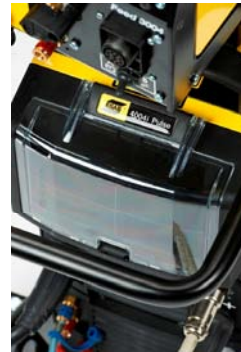
Compartment for wear parts